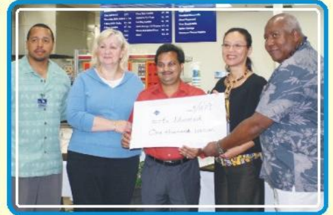
The Power of ONE Team Receiving check from Sam's Club Foundation