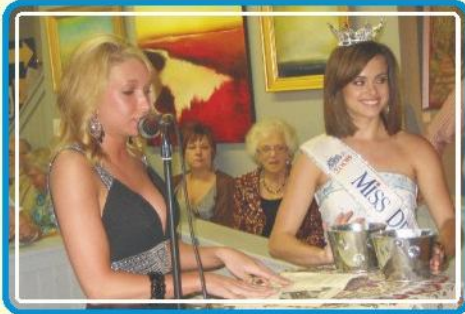
Miss Delaware 2008 and 2009 Addressing Guests of The Power of ONE