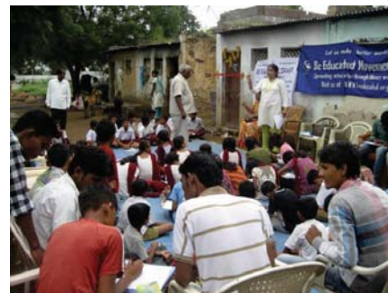
Children gathered during the opening of library in Maharashtra (India)