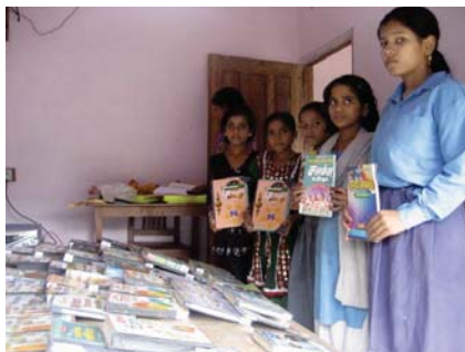
Village girls showing books. Library recently opened in UP India,