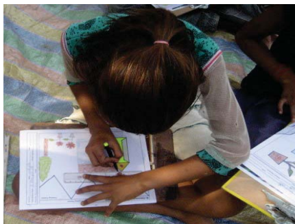
A girl from Andhra Pradesh Village busy drawing portrait for Drawing competition