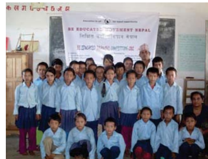
Children from Nepal Library NP004 participating in drawing competition