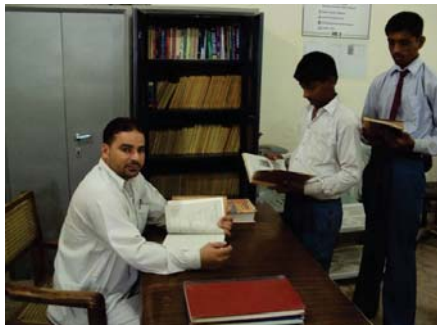
Be Educated Library in Pakistan