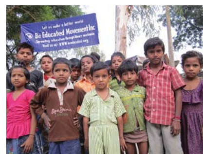
Children during the opening of a library in Gorakhpur in Nov 2011