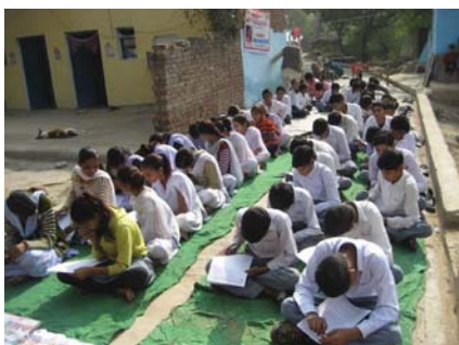
Children participating in Intellectual Search in India